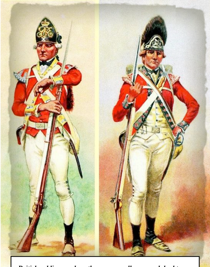
British soldiers such as these were well-prepared, had top-notch weapons, and a ready supply of gunpowder and food.

Even with their great advantages, war in colonies presented Britain with many problems. First, the distance between Britain and America presented a problem for timely shipments. Sending troops and supplies was very slow, since it had to travel by boat across the Atlantic. Too, this travel was very expensive. Important messages that needed immediate delivery faced the same difficulties - news of battles arrived in England long after they occurred, making planning very difficult.