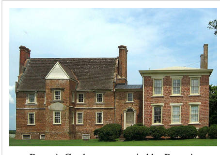
Bacon's Castle was occupied by Bacon's followers during the rebellion

It was the first rebellion in the American colonies in which discontented frontiersmen took part; a similar uprising in Maryland